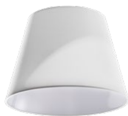
Shade ZF WH