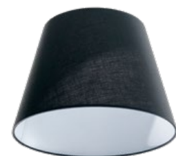
Shade ZF BK