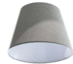
Shade ZF GR