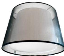
Shade DS 43 WH