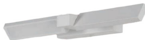
Arno IP44 CCT Switch CH AZ5888